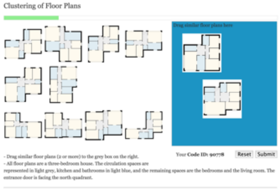
Figure 2: Task Panel of the survey. Users must drag-and-drop to the blue area the floor plans presented on the left according to their notion of similarity.